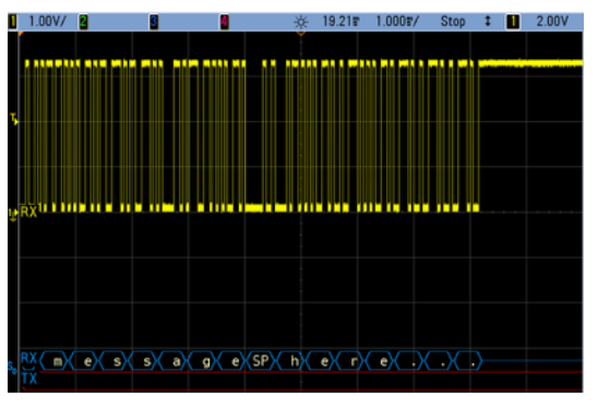
OUT: Partial view of the fully decoded, rail-torail digital signal showing a printable ASCII message received from the target's LED at 19.2 kbps.